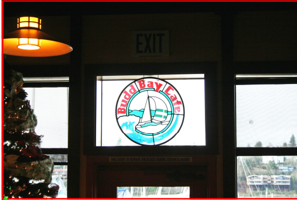
The Budd Bay Café in Olympia Washington